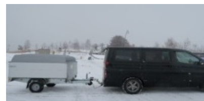
Look of Traction Vehicle &amp; Alphard

We will refill Free beverage everyday! Please drink Anytime! <Contents> White wine , Rose wine ,Mineral Water Some Side dishes & Glasses