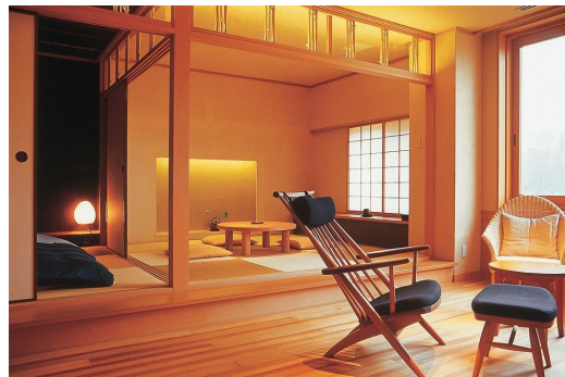
Tokachigawa ONSEN SANYOAN Rakuyou (Private Onsen bath in room)

&lt; ex. : Accommodation &amp; Guest Room &gt;