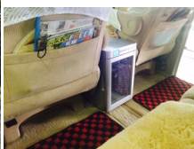
Special Equipment Refrigerator

We will refill Free beverage everyday! Please drink Anytime! <Contents> White wine , Rose wine ,Mineral Water Some Side dishes & Glasses